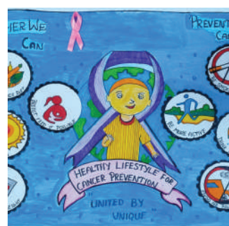
March 2025 Edition