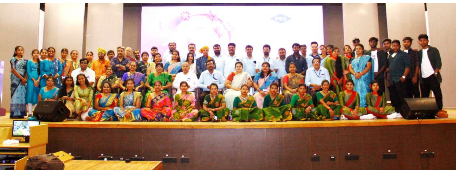
Coordinators & performers during International Womens Day celebrations at PSG IMSR auditorium.