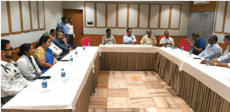
EMR STEERING COMMITTEE MEETING AT JADE