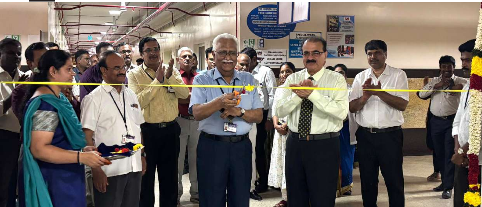
Opening Ceremony of the New Wing in the Special Ward