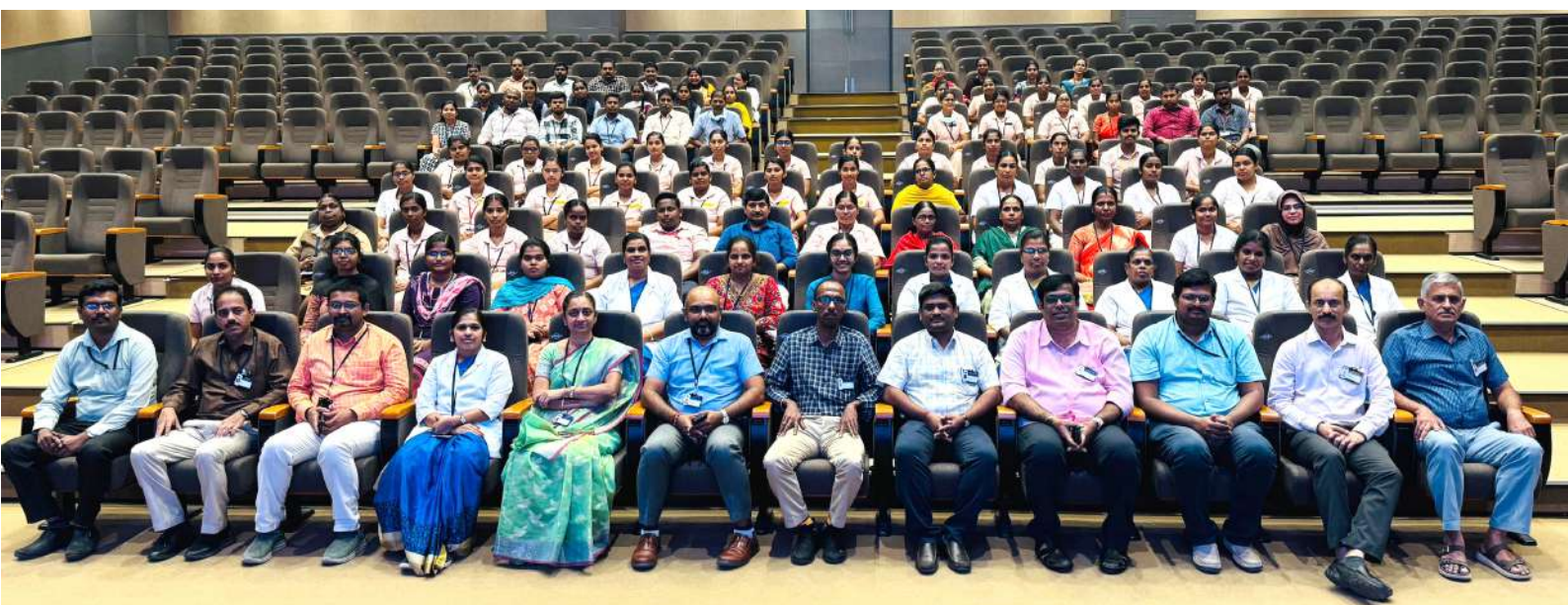
Dec 2024 Edition contents Contributors Meet - 08 Jan 25